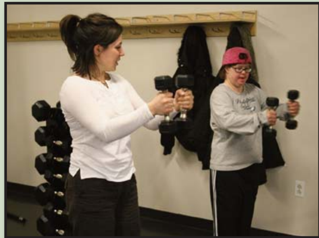
Rowan Health and Exercise Science Student aiding a Get FIT Participant in using free weights.

Launched in October to address the limited accessibility of daily recreational activities for individuals with Intellectual and Developmental Disabilities, the Get FIT initiative of the Family Resource Network aims to improve the health and fitness of this population through the promotion of diet, exercise, and behavioral modifications. Although specific programs vary based on the abilities of each facility, all include health screenings, pre- and post- evaluations of participants, analysis of data findings and staff and participant training in Get FIT core concepts.