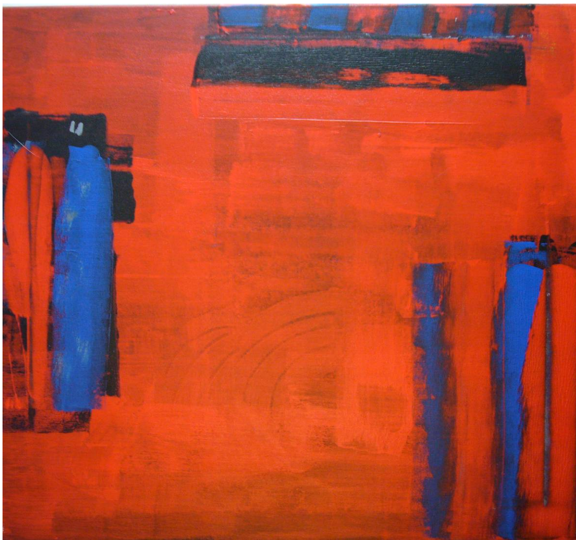
Figure 4. Red Painting 1 , acrylic on canvas, 24" x 24", 2008.