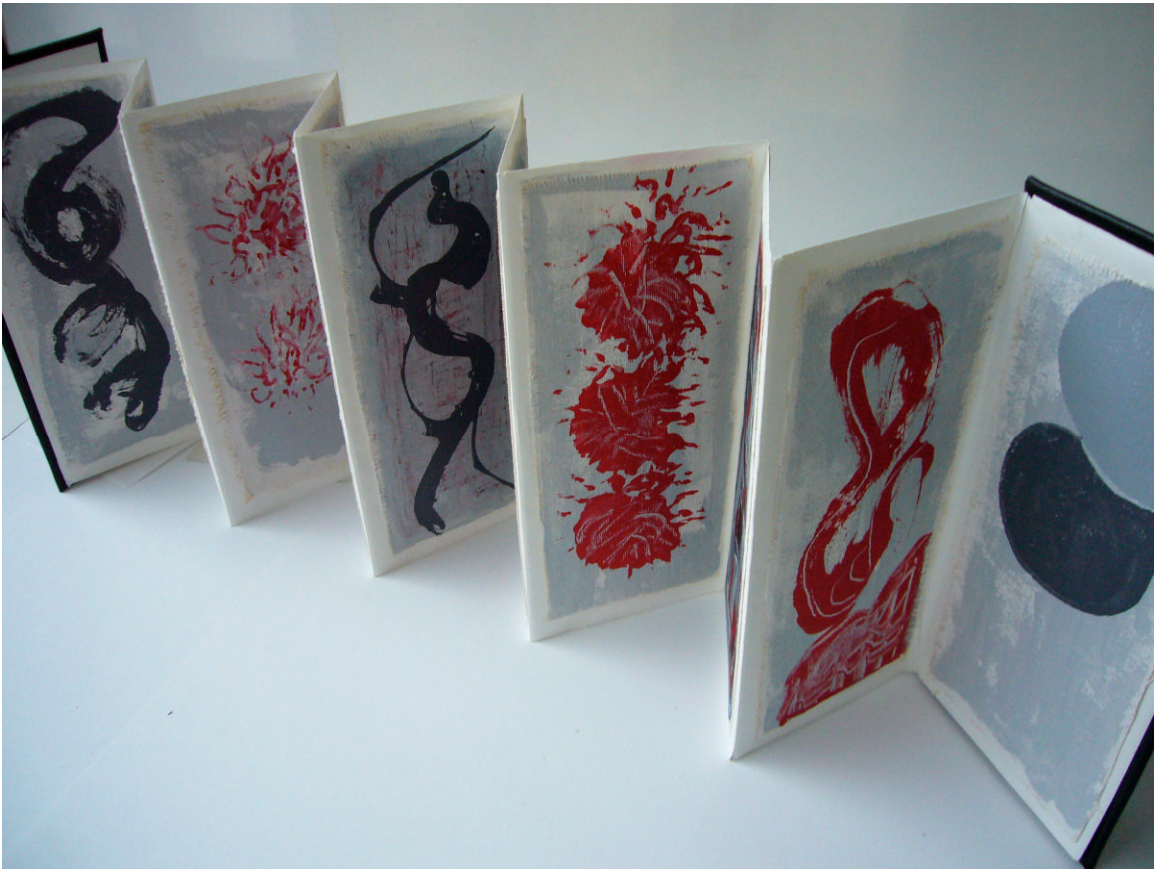
Figure 5. Envelope Book , mixed media, 10" x 51" x 1", 2008.