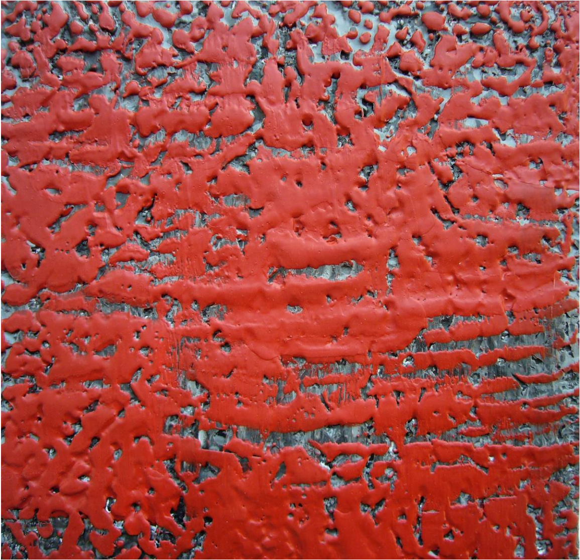
Figure 7. Cadmium Red 2 , encaustic on wood panel, 11" x 11" x 1", 2009.