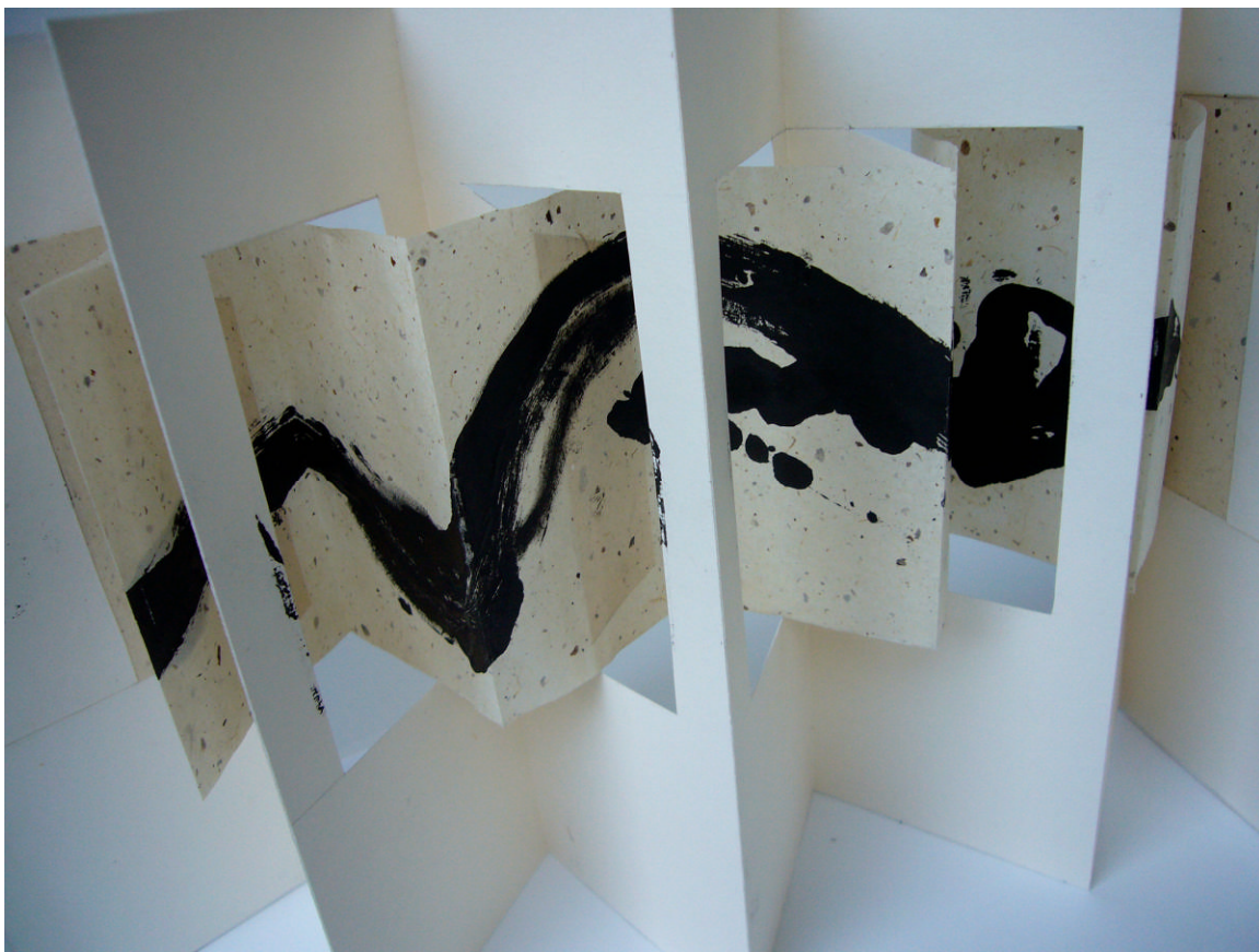
Figure 6. Accordion Book 1 , mixed media, 10-1/2" x 27" x 3/8", 2008.