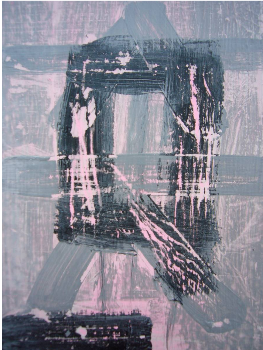
Figure 8. Contemplation , acrylic on paper, 6" x 4-1/2", 2009.