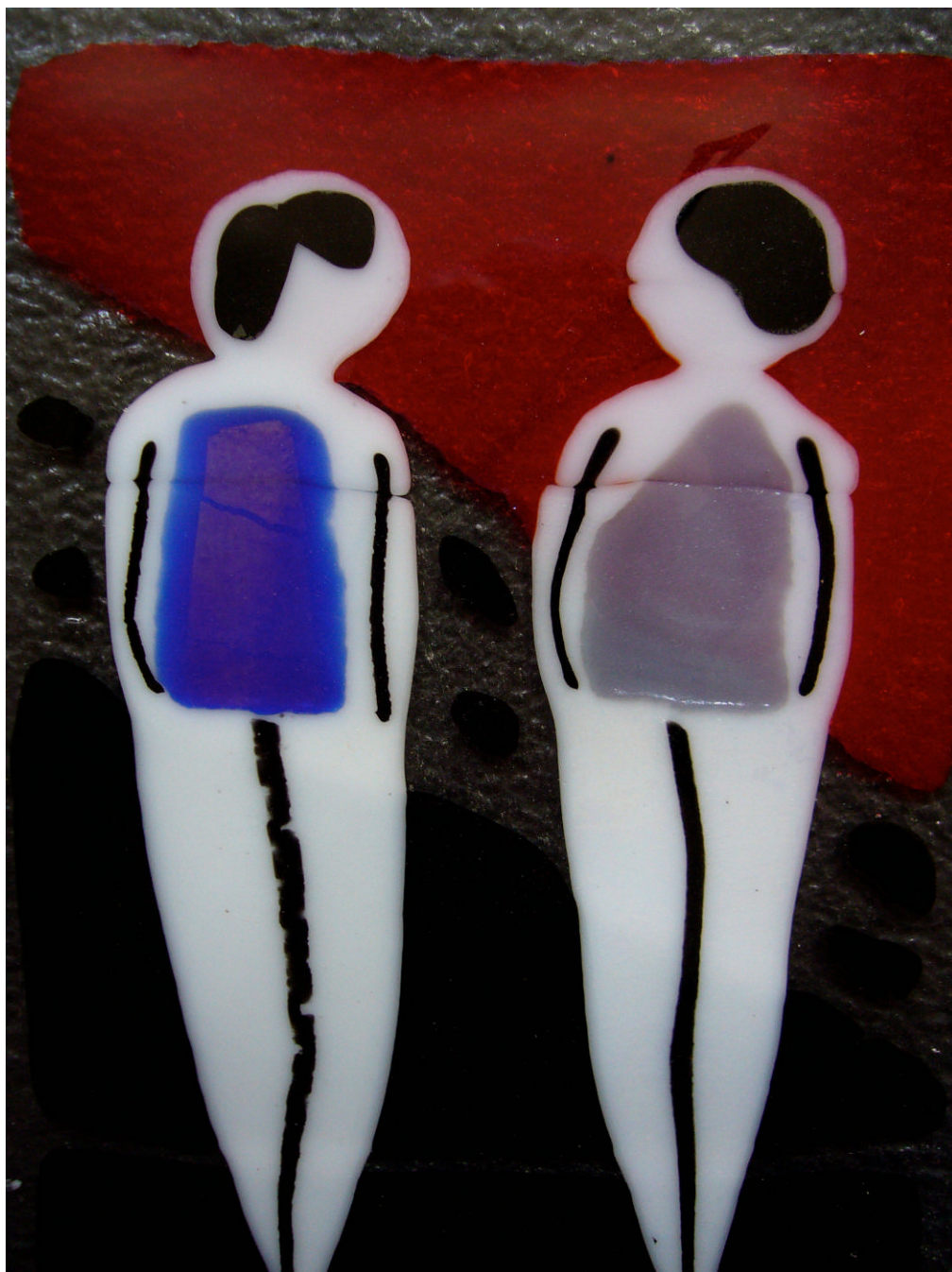
Figure 2. Walking Couple , glass, 10-1/2" x 7-1/2" x 1/8", 2006.