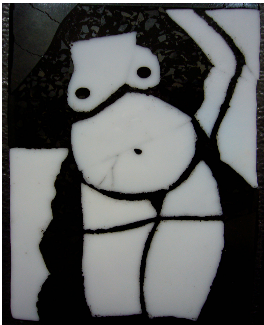
Figure 1. Black and White Nude , glass, 10-1/2" x 7-1/2" x 1/8", 2006.