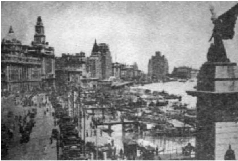
Fig. 2. The pre-1949 Bund.

century, high-rise buildings in Art Deco style resembling those in New York dotted the city and became symbols of wealth (Shanghai arguably has more Art Deco buildings than any other city in the world. See Streshinsky (2000) ). A new height of urban development was achieved in the 1930s with the construction of more skyscrapers. Every country and every style was represented somewhere in Shanghai.