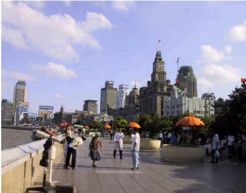
Fig. 6. The Bund today.

a 'Historical Protection Zone' and a special agency has been helping relocate government departments in the historic buildings (Streshinsky, 2000; Balderstone et al. , 2002). The old Shanghai Club, Cathay Hotel, Hong Kong and Shanghai Bank building, and other historic buildings of the early 20th century are being preserved. But the Bund's preservation really has less to do with restoring the buildings than it has to do with widening the street and becoming a new tourist attraction (see Fig. 6). It is motivated more by the vision of a new Shanghai to rival the old than simply nostalgia for the past glory. Through this promotion of the heritage industry, the government also asserts itself forcefully in the city's future development (Abbas, 2000).