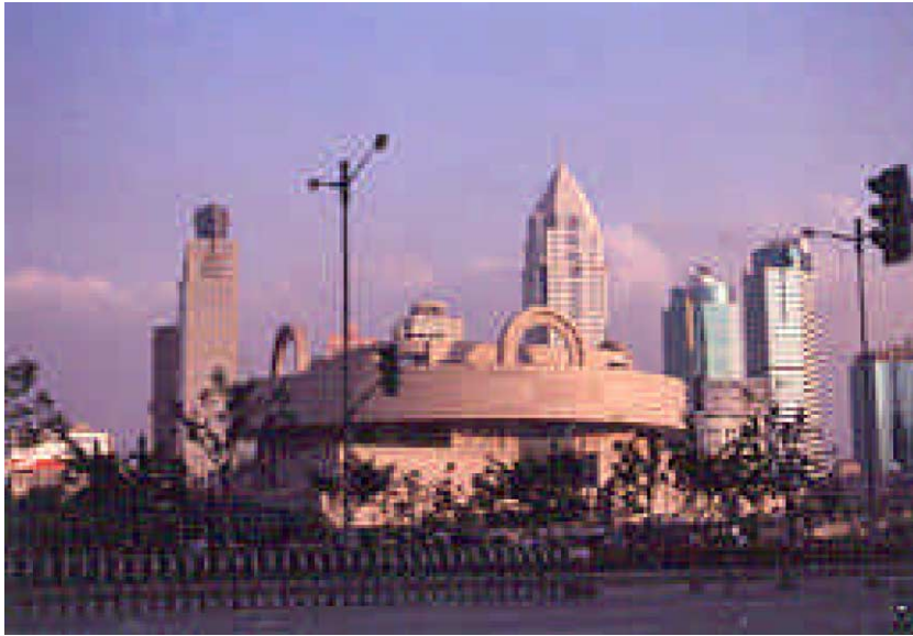
Fig. 4. Shanghai Museum.

theater, a new expansive convention center (Fig. 5), and one of the largest libraries in the world (Yin, 2000; ‘Art Rivalry’, Time International , 10 April 2000).