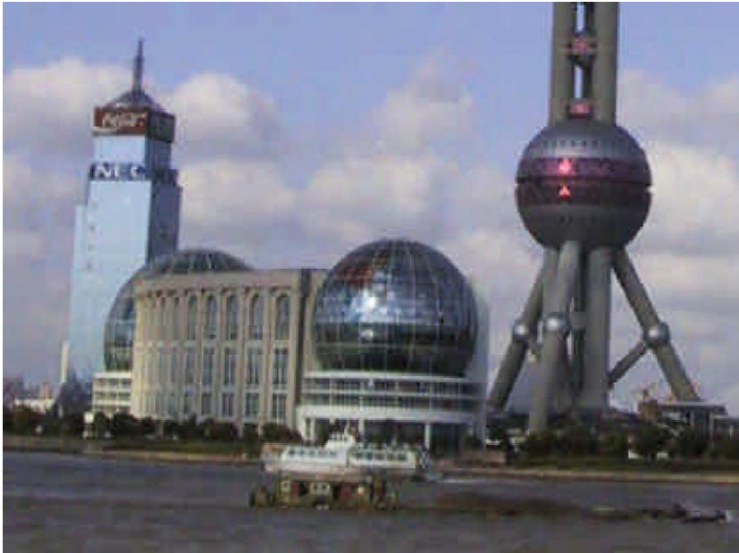
Fig. 5. New convention center.

picture industry, which gave the city the title of “Hollywood of China” in the 1930s. Recently a powerful animation company has been set up, with dreams of becoming China’s Disney and subsequent creation of the nation’s first higher-learning animation program (‘China Sets Sights on Animation’, Variety , 3 January 2000).