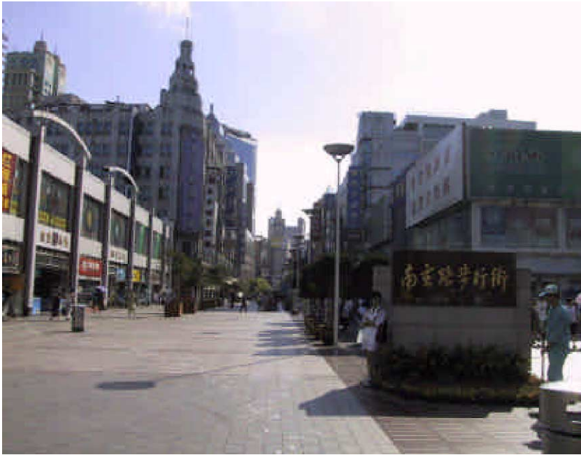
Fig. 7. The new Nanjing Road.