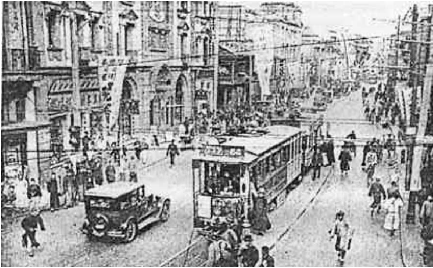
Fig. 3. Nanjing Road in the 1930s.

Other new forms of urban space came into being with commercial development and under Western influence, including cinemas, coffeehouses, theaters, dance halls, parks and racecourse (Lee, 1999; Lu, 1999a). These institutions were linked with leisure and entertainment and more accessible by native residents, while the high-rise buildings remained beyond the reach of the average Chinese. Together these places of leisure and entertainment, largely located in the foreign concessions, became the central sites of Shanghai's urban culture. Many of these imported new forms of urban space also were integrated with elements of Chinese design. Some traditional Chinese architecture even survived, as shown in the authentic Chinese structures and garden of the old city just a short distance south of the Bund.