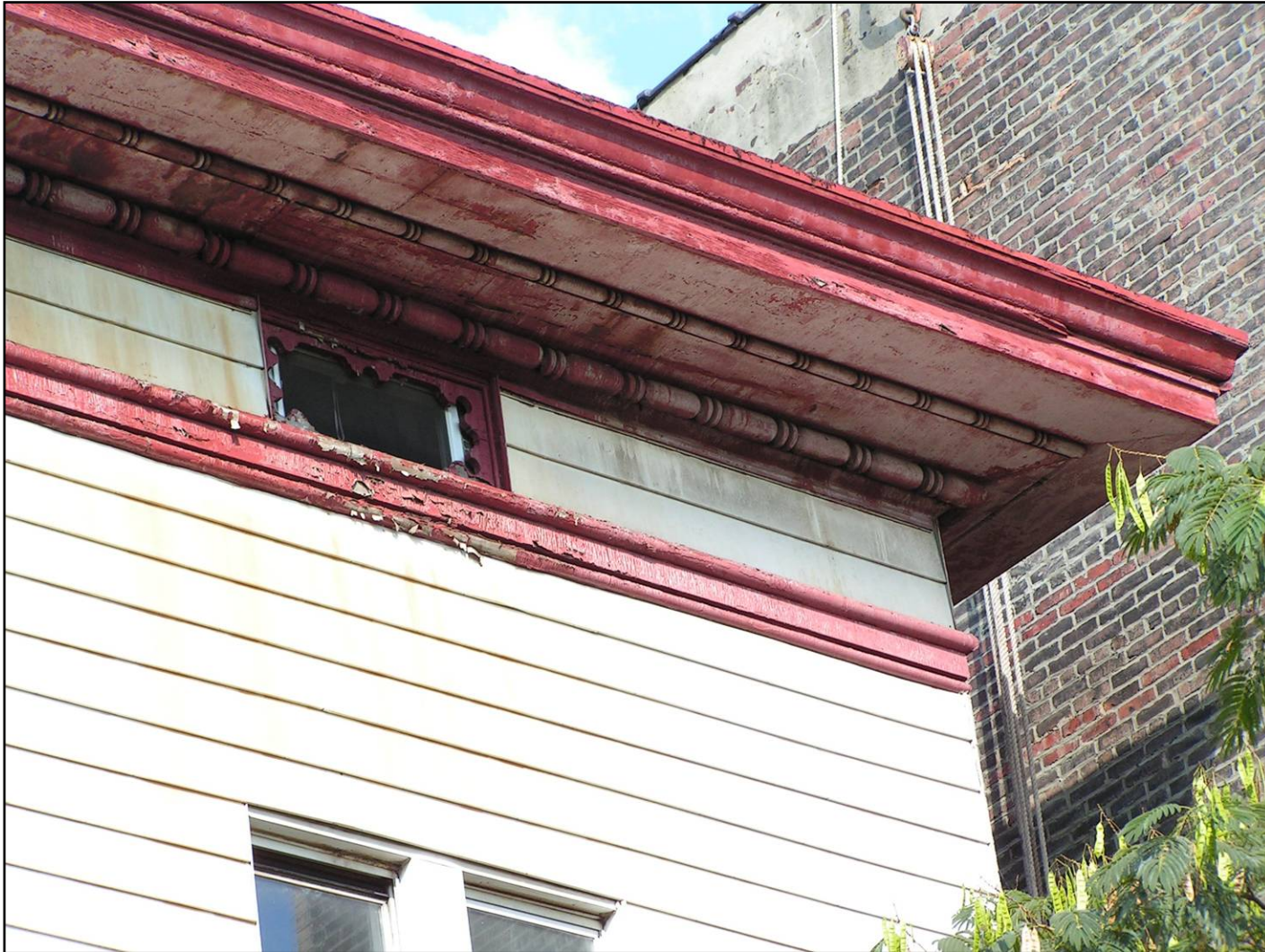
George B. and Susan Elkins House, cornice and attic window details.