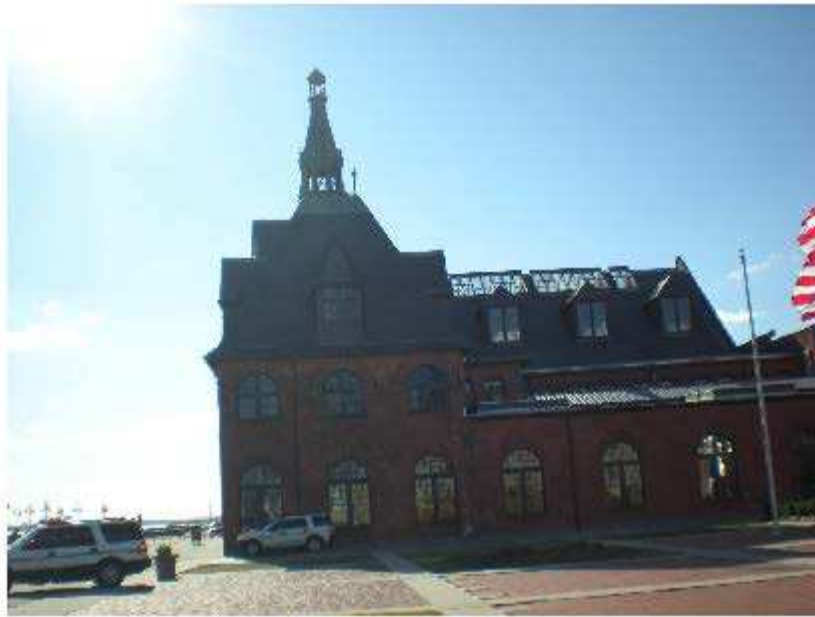
Terminal North View