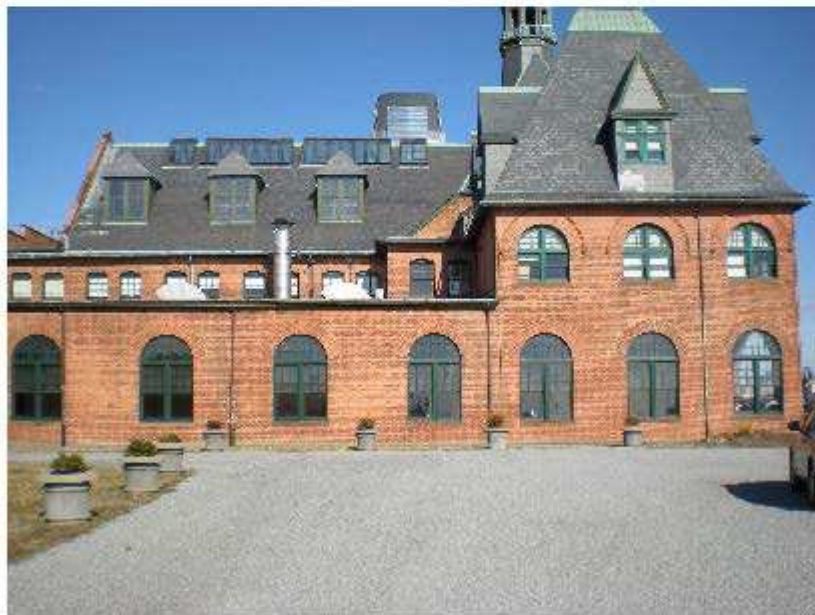
Terminal South View