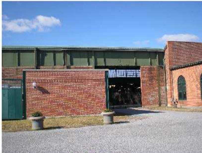
Concourse East View