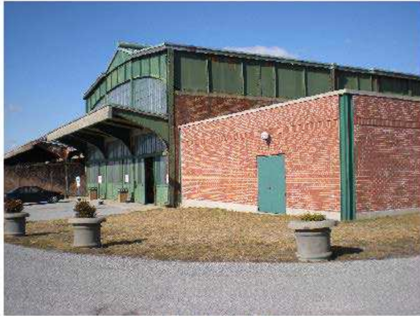
Concourse Southern View