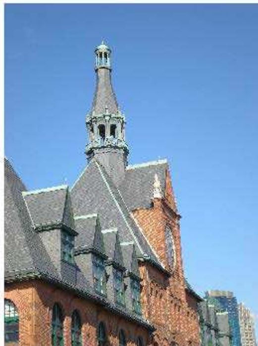
Terminal Roof Detail