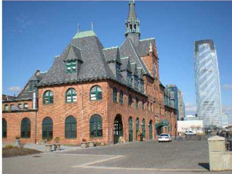
Terminal Southeast View