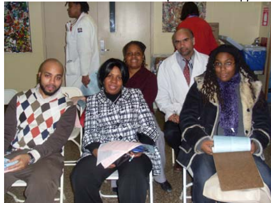
Employees waiting to donate blood.