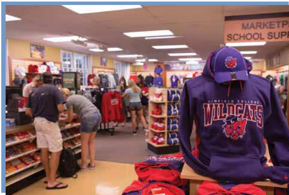
McMinnville Campus Bookstore

***Extended Hours Available during the 1st Week of Classes Please call to confirm ***