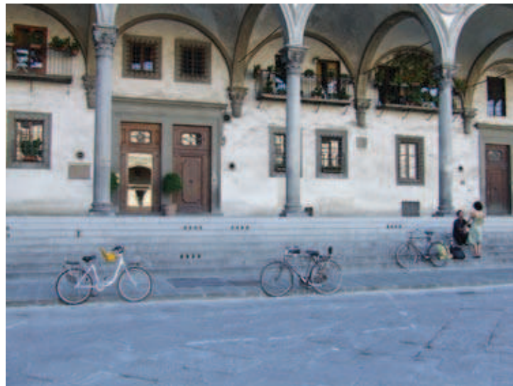
Amore in Piazza Santissima Annunziata, Firenze

She has had a number of photography shows at MCC and exhibited in Rochester City Hall her 1st prize winning photograph for the 1991 Ice Storm. In 1997 she partici-