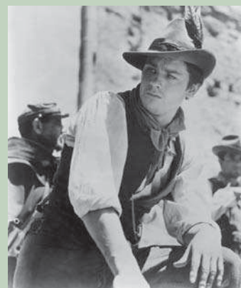
Alain Delon on the set of Il Gattopardo.

This year marks the 35th anniversary of the death of one of Italy’s most distinguished theater and film directors, Luchino Visconti. In commemoration of Visconti’s life and work, the Casa is presenting a semester-long film series in which each film will be preceded by an introduction from a Nazareth College professor. In connection with the Casa’s theme of “150