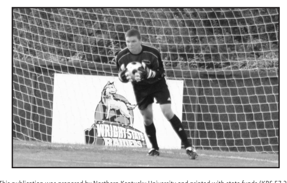
This publication was prepared by Northern Kentucky University and printed with state funds (KRS 57.375) Equal Education and Employment Opportunities M/F/D. 12907

Payment of fees may be made by personal check or money order made payable to NKU Sports Camps. The required deposit and enrollment fees are listed on the attached registration form. Complete payment of fees for each camp must be made by July 1, 2009. Upon receipt of a deposit, a confirmation letter will be forwarded. Refunds of enrollment fees will be made prior to the first day of camp, minus a $25 nonrefundable deposit. Once a camp begins, refunds will only be issued for those medical reasons supported by a physician's statement and only until September 1.