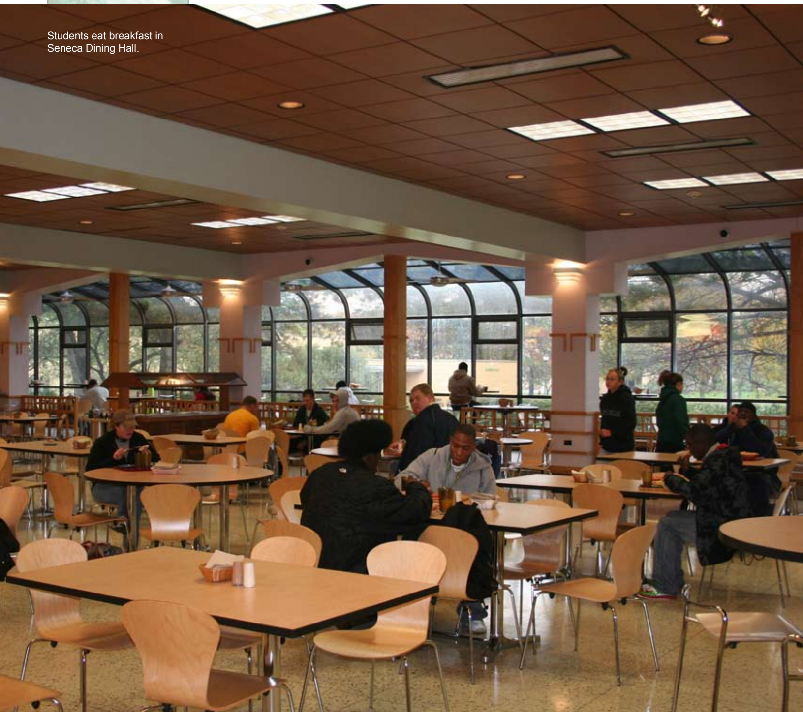
Students eat breakfast in Seneca Dining Hall.

Visit: http://events.morrisville.edu for a complete listing of events