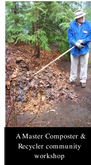
A Master Composter & Recycler community workshop

~ Make a difference in the state & in local communities