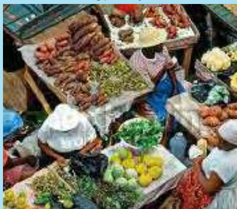
The lively markets of the Caribbean islands offer local treats, including fruits, spices and rum.

A collection of pre-Columbian artifacts from the original inhabitants, the Arawak Indians, can be found in St. John's Museum of Antigua and Barbuda. Optional tours include: historic Antigua; art studios of the island; aerial canopy excursion; helicopter flight over paradise; and off-the-beaten-track island exploration by SUV.