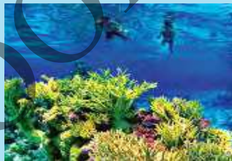
The Lesser Antilles' pristine coasts and secluded coves make ideal snorkeling sites.

capital city, St. John's, is English Harbour, a meticulously restored 18th-century naval dockyard that was the home port of Admiral Lord Nelson and his British fleet. Just above the dockyard, Nelson's lookout point on Shirley Heights offers spectacular views of the neighboring islands, Montserrat and Guadeloupe. There are over 80 archaeological sites on Antigua, the oldest dating back over 4,000 years.