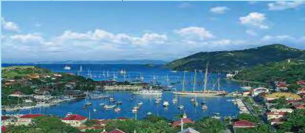
Sailboats speckle the cerulean waters surrounding Gustavia, St. Barts, a posh holiday destination notable for its distinct Breton, Norman and Swedish influences.

The French West Indies island of St. Barts was once a destination exclusive to the rich and famous, chic and stylish, yet casual. The island is known for its secluded coves, pristine beaches and hillsides dotted with