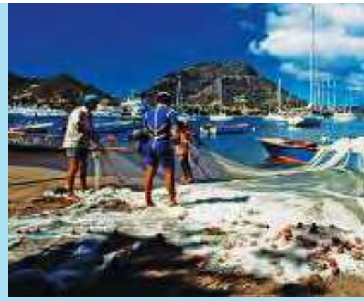
Island fishermen ready their nets for catching some of the fresh fish in the Caribbean.

Cruise into the sheltered natural harbor of Guadeloupe, a région of France, to Pointe-a-Pitre, the island's largest city and economic hub, featuring the liveliest market in the Caribbean. The colorful jamboree of goods to be found on the pier of Quai de la Darse includes local handicrafts and treats such as fine Creole jewelry and colorful dolls, bamboo hats and woven baskets, fruits, rum and spices, as well as French imports. The unique culture of this island is highlighted by the Musée St. Jean Perse, devoted to the island's own Nobel laureate poet, and the Musée Schoelcher, a showcase of items belonging to the abolitionist Victor Schoelcher. Just a few blocks north of the quay, the steel Cathedrale de St. Pierre et St. Paul, designed by Gustav Eiffel is only one of the many French imports on the island. One need travel just outside the city to explore the lush tropical flora and exotic fauna of the island. Optional shore excursions are available, including a treetop canopy walk through the tropical