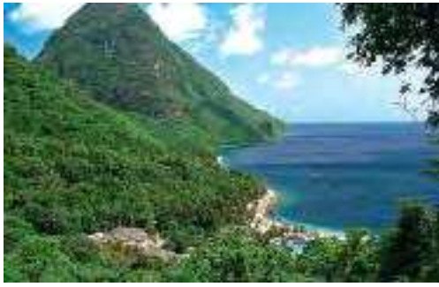
The Petit and Gros Pitons of St. Lucia are the island's most recognizable features, and are part of a UNESCO World Heritage site.