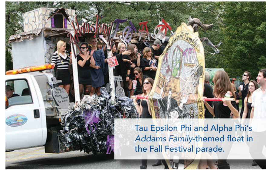
Tau Epsilon Phi and Alpha Phi's Addams Family-themed float in the Fall Festival parade.