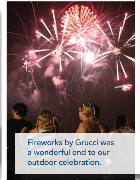
Fireworks by Grucci was a wonderful end to our outdoor celebration.