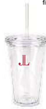
Insulated Clear Cup