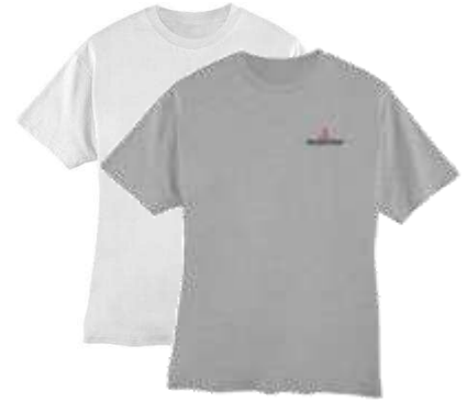
Ladies' Heavyweight Tee