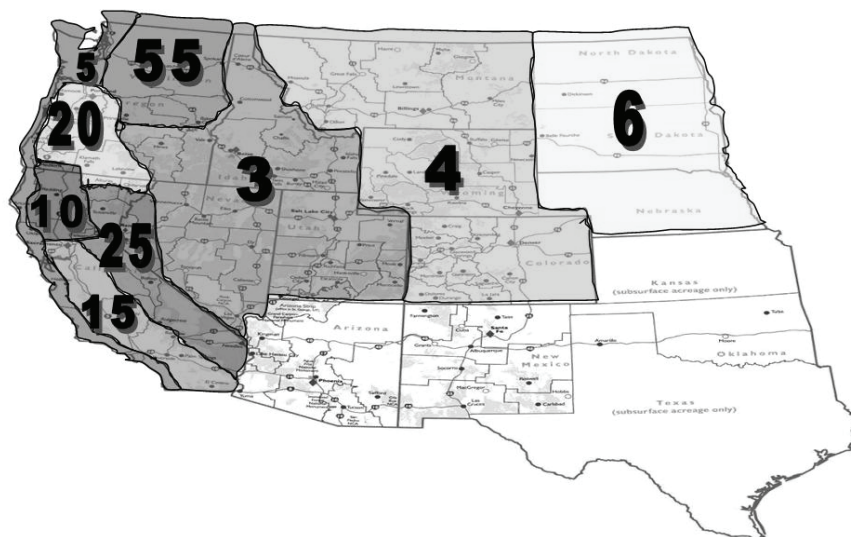
Table one provides the eleven year average (1997 to 2007) price discounts per hundred weight between different locations in the west as compared to prices received in the Midwest.

(Figure 1) The Western States were divided up into marketing regions