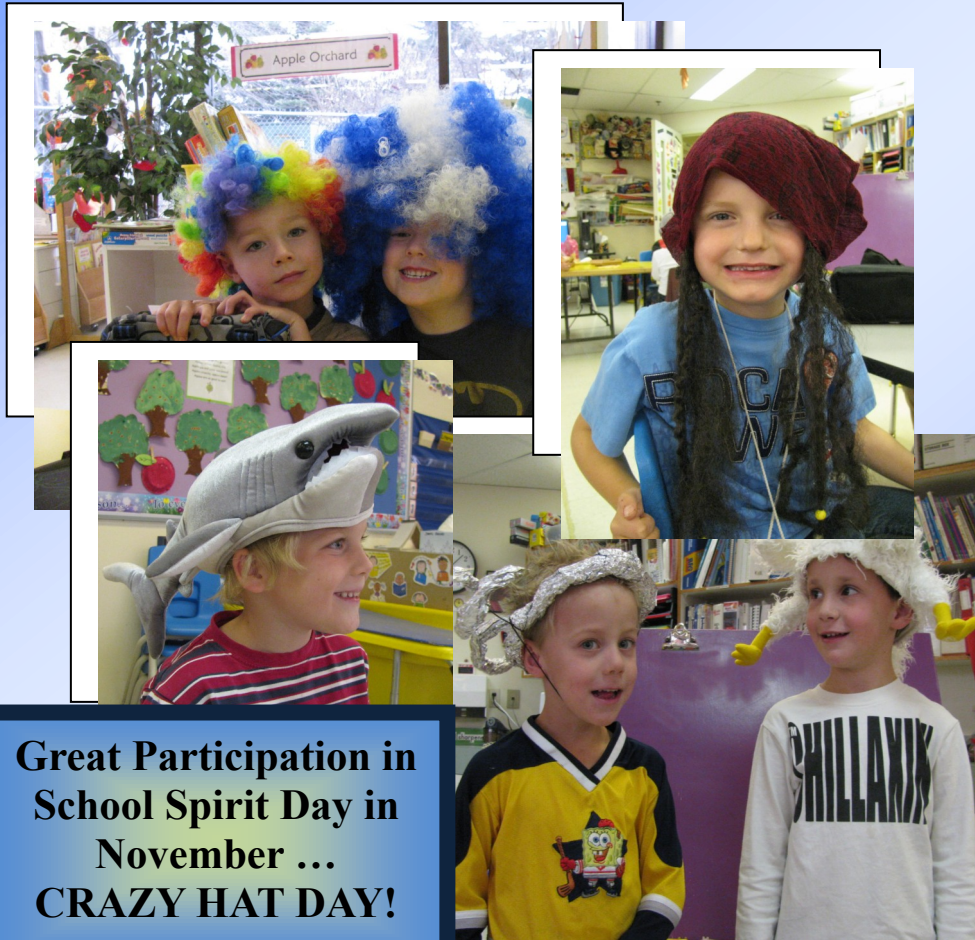
Great Participation in School Spirit Day in November ... CRAZY HAT DAY!