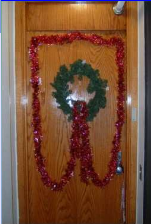
(Decorating Classroom Doors)

The Spirit of Christmas will be expressed From DOOR to DOOR