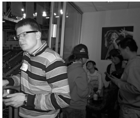
Scenes from the January 25th Basketball Outing