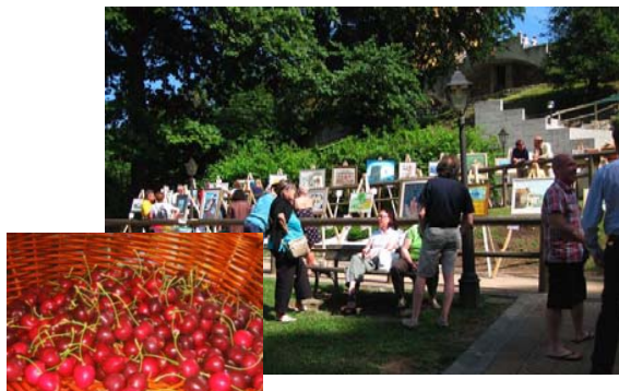
Relaxing with cherries while waiting for winners