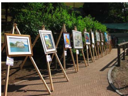
Artwork on open-air