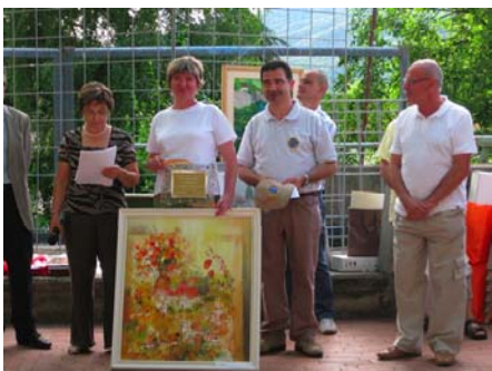
2009 - 2° awarded artwork