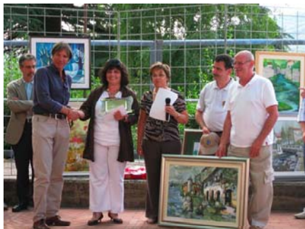
2009 - 1° awarded artwork