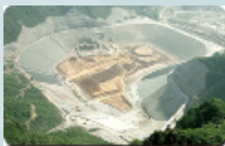
Baoquan Pumped Storage Power Project Upper Reservoir: Rockfill dam with asphalt concrete, H=94.8m Lower Reservoir: Masonry Dam, H=95m Installed Capacity: 1200MW