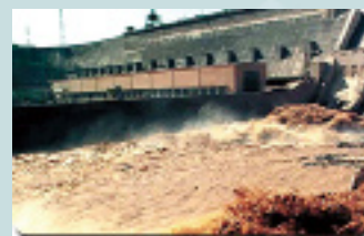
Sanmenxia Project Concrete Gravity Dam H=106m Installed Capacity: 400MW