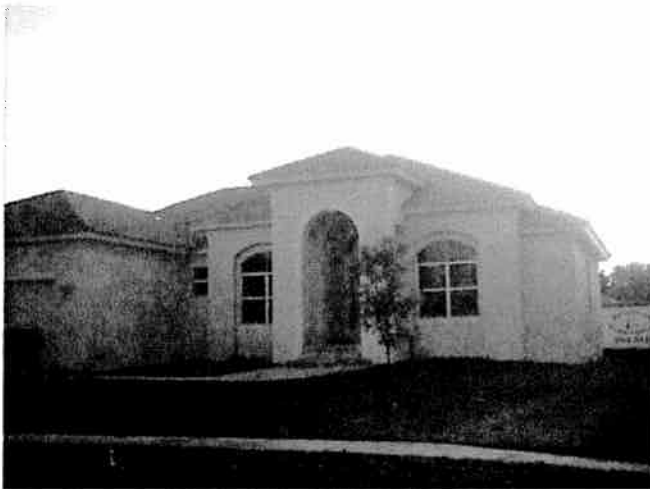
Front Property Picture

If using the Elevation Certificate to obtain NFIP flood insurance, affix at least two building photographs below according to the instructions for Item A6. Identify all photographs with: date taken; "Front View" and "Rear View"; and, if required, "Right Side View" and "Left Side View." If submitting more photographs than will fit on this page, use the Continuation Page, following.