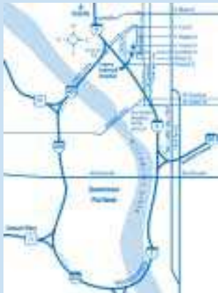
Legacy Emanuel Children's Hospital Emanuel Hospital & Health Center