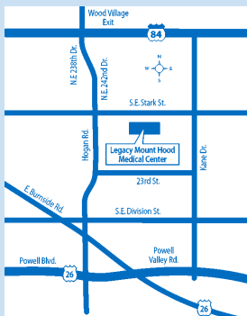
Legacy Mount Hood Medical Center