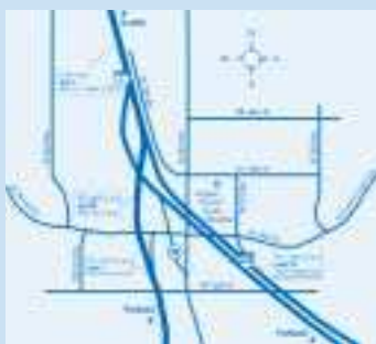
Legacy Salmon Creek Hospital