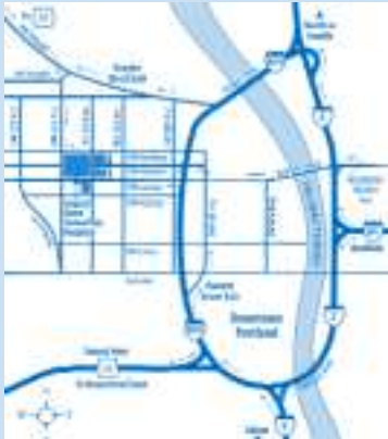
Legacy Good Samaritan Hospital & Medical Center