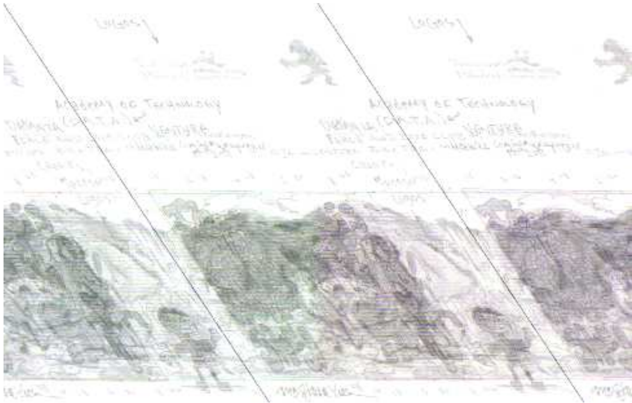
Color scale rendering of bike path mural design