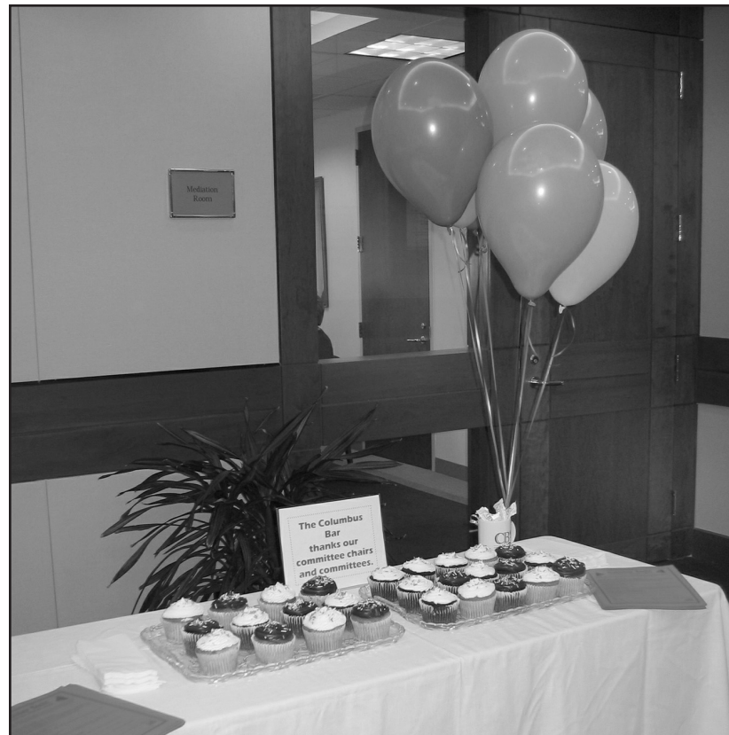
The Columbus Bar thanked committee chairs and members with cupcakes.