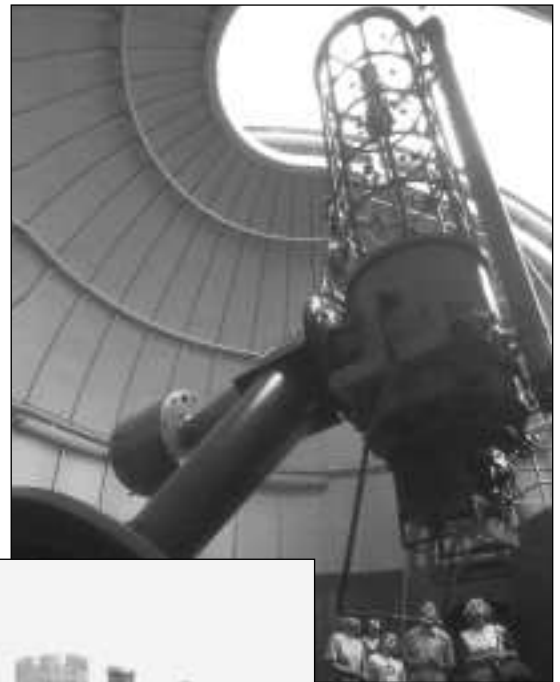
Above: Herstmonceux Observatory and Science Centre Left: Herstmonceux Castle and moat