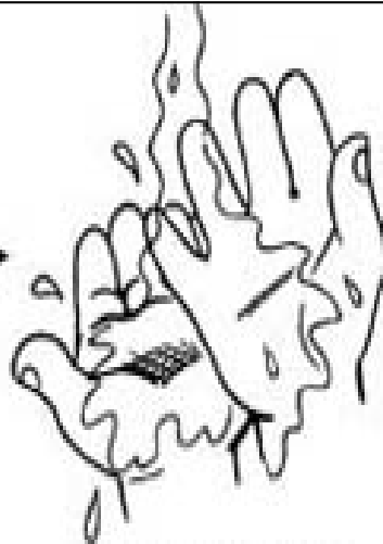
1. Wet hands