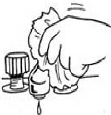
6. Turn off taps with towel