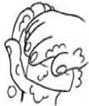
2. Soap (20 seconds)