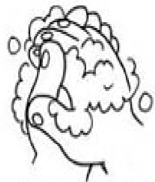
3. Scrub backs of hands, wrists, between fingers, under fingernails.