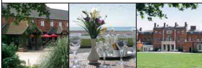
The Olde Barn Hotel Marston, Lincs, NG32 2HT

Please note there are no seminars or set hands on these weekends