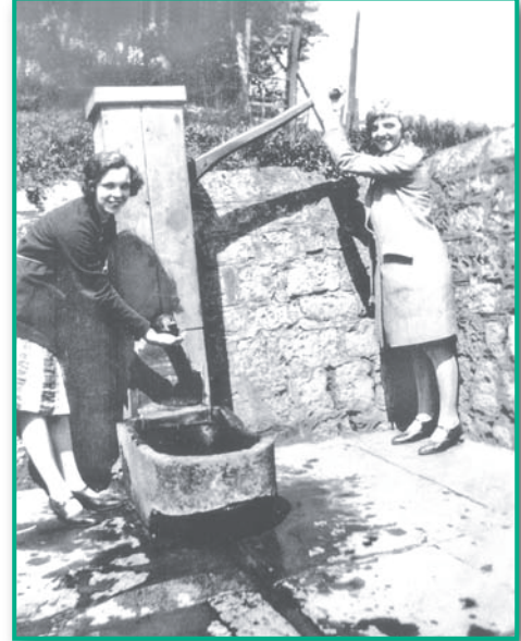
Flashback - the old pump in use.

Before sealing off the cairn the volunteers will place a time capsule inside it, containing local items of interest depicting life in the local area in 2011.