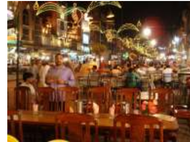
Food Street, Lahore

Registration details for the local delegates are provided in the Registration for Local Delegate form. Registration fee for the local delegates and their accompanying spouses will cover 3 days conference lunch, refreshments and conference materials only. If they intend to avail other benefits like gala dinner, technical tour etc; they are to pay actual costs thereof to be obtained from the Conference Secretariat. Local delegates, if intend to avail ACEP arranged accommodation, shall have to pay additionally at the same rate stated above.