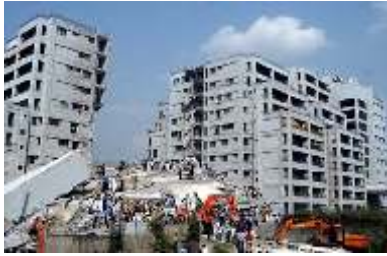
Earthquake destruction in Islamabad, Pakistan