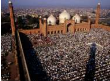
Badshahi Mosque, Lahore

Lahore, the city of gardens and educational institutes is the second largest city in Pakistan with a population of nearly 7 (seven) million. This historical city is located near the River Ravi and is the capital of the Punjab Province. Apart from being the cultural and academic center of the country, Lahore is the Mughal “Show-Window” of Pakistan. Beautiful gardens, historical forts, mosques and shrines, Mughal architectures and museums, fairs and festivals all add-up to make Lahore a city loved by all. There are ample destinations of tourist interest in Lahore that makes it a city worth visiting.