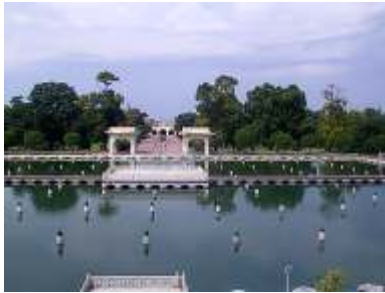
Shalamar Garden, Lahore

On the occasion of the Conference, a souvenir would be published containing messages from dignitaries, articles on the theme topic and advertisements.