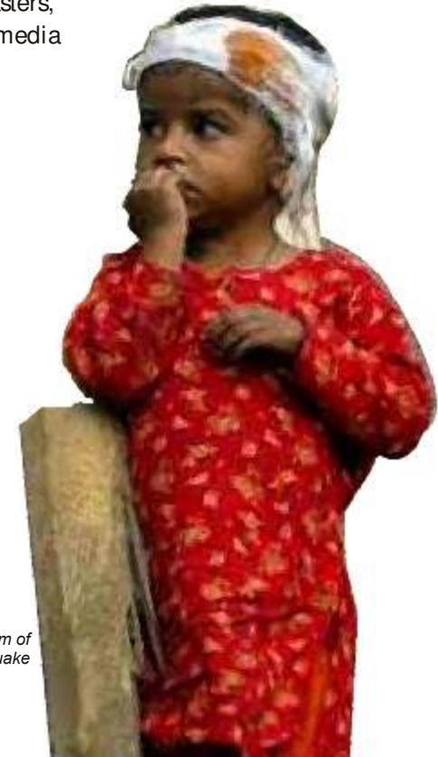
An innocent victim of earthquake