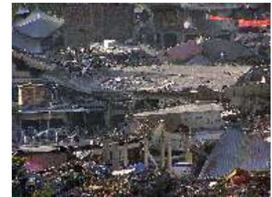
Balakot City after being hit by Earthquake