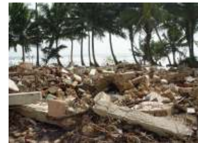
Disaster caused by Tsunami in Indonesia