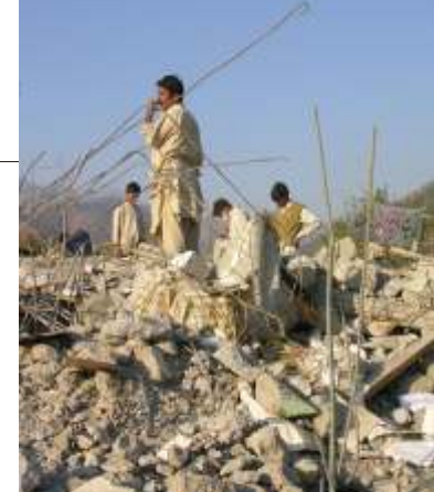
Earthquake devastation at Muzaffarabad, Pakistan

The theme of the Conference “Engineering and Disaster Management” is selected in view of the disasters caused in the recent past by Tsunami in Indonesia and earthquake in Pakistan. Untold loss of human lives and properties raised the questions whether UN-ESPAC region is equipped with the latest technological advancement to forecast, monitor, prevent and manage such disasters? Whether role of engineering in design, material selection and construction of facilities is adequate?