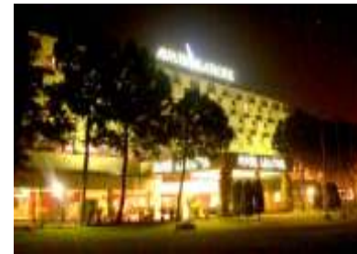
Hotel Avari, Lahore

A delegate, foreigner or local may stay at his/her own arranged accommodation, however, whereabouts of such arrangements shall be intimated to the Conference Secretariat. In such case, the delegate is to pay only Registration Fee. ACEP has negotiated with Hotel Avari (five star hotel) which is also the Conference Venue, a special four nights package as accommodation charges inclusive of all taxes as above. Accommodation charges include complementary breakfast and airport pick and drop facilities. Number of rooms for such package is limited and will be offered to persons on first cum first serve basis through the Conference Secretariat. Upon reservation of the allocated rooms, guests will be offered alternate accommodation on the same charges.