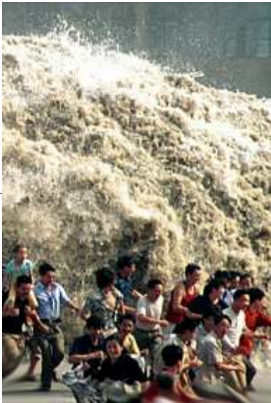
Havoc caused by Tsunami in Thailand