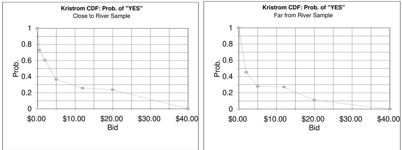
Figure 2. Nonparametric Inverse Cumulative Distributions

Unlike the Turnbull, the bid that drives the probability of acceptance to zero must be specified by the analyst if the survey does not reveal it, so Kriström's mean depends in part on this arbitrary value. To construct the empirical cumulative densities pictured above, a conservative upper limit of R$40 for b_{M+1} was assumed, which is approximately three percent of average household income (see Ardila et al. 1998). Tables 12 and 13 show the calculation steps.