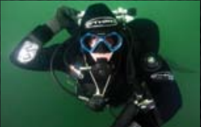
South Coast, UK : Mark Powel

O’Three have gained a unique reputation for producing high quality individually customised dry suits and delivering customer care that is at the very core of everything we do.