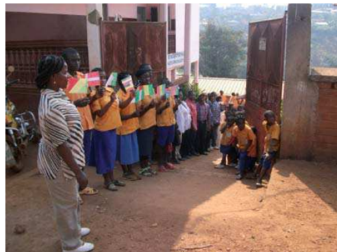
CERSOM pupils and staff welcoming the WCARS Board members and facilitators