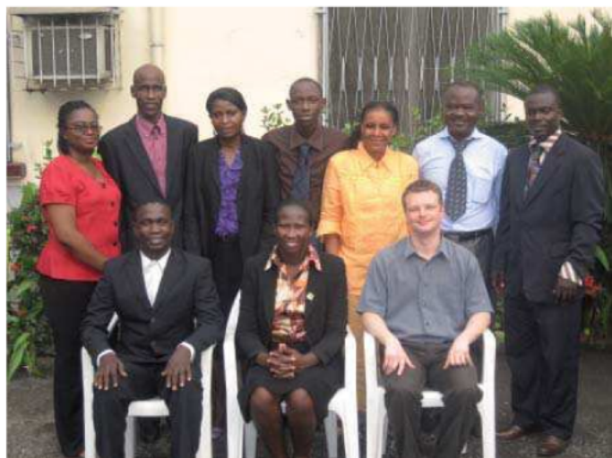
Group Photo of Members of the WCARS Board with Training Facilitators