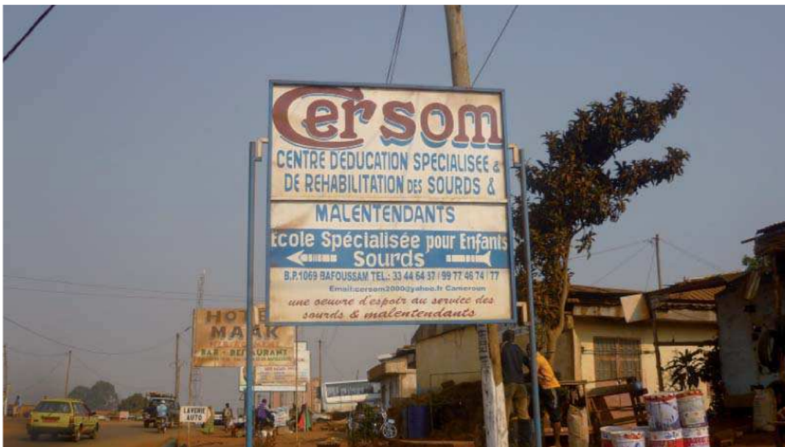
Sign Post of Centre d' Education Specialisee et de Rehabilitation des Sourds et Malentendants

One day was set aside for WCARS Board members and training facilitators to visit a deaf school in Bafoussam, 350 kilometres west of Douala. The group visited the Centre d' Education Specialisee et de Rehabilitation des Sourds et Malentendants (CERSOM) in Bafoussam, one of 15 deaf schools in Cameroon established by deaf individuals.