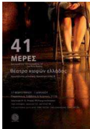
Poster of the Greek deaf theatre