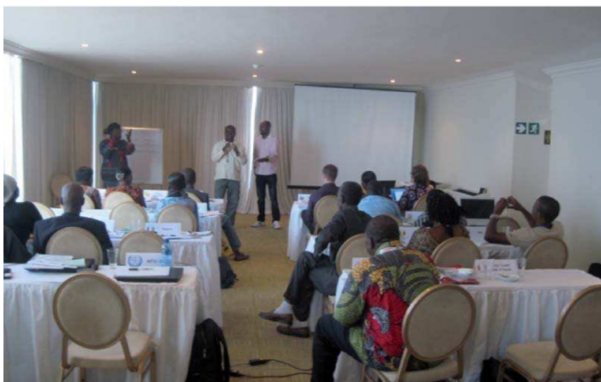
WCARS General Assembly in Progress at Blue Waters Hotel, Durban South Africa, July 2011