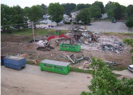
June 6, 2005 – Down went the Health Services building