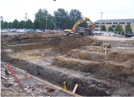
September 9, 2005 – In came contractors to dig out our "space"