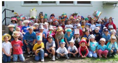
Bishop Creek Grade School "Hats Off to Education Day" inspired by hats in Aladdin

Plans are to continue the tradition of a children's performance with a week of daily performances at the Village Theatre. Spring 2007 The Frog Prince , will be presented April 16-21.