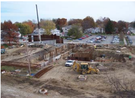
November 11, 2005 – Up go concrete brick walls and foundations.