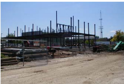
May 17, 2006 – Up go the steel structures

http://www.eiu.edu/~physplnt/Doudna/index.html