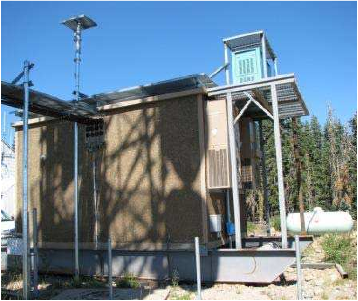
Facility 4 – US Cellular