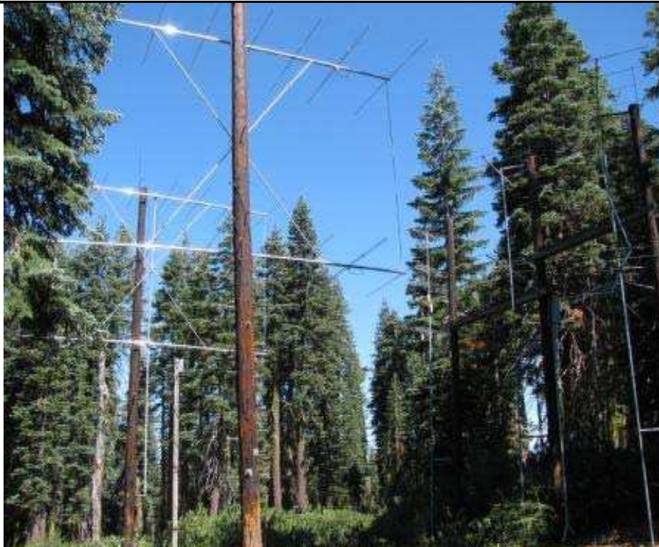
Facility 1 – Community TV Association