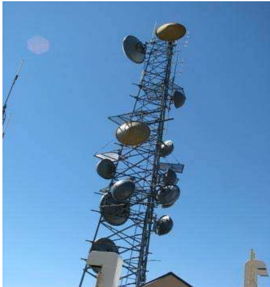
Facility 2 – Union Pacific Railroad