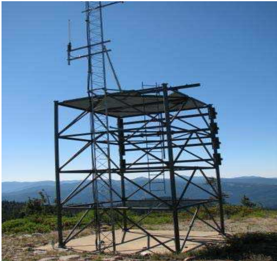
Facility 3 – USDA Forest Service