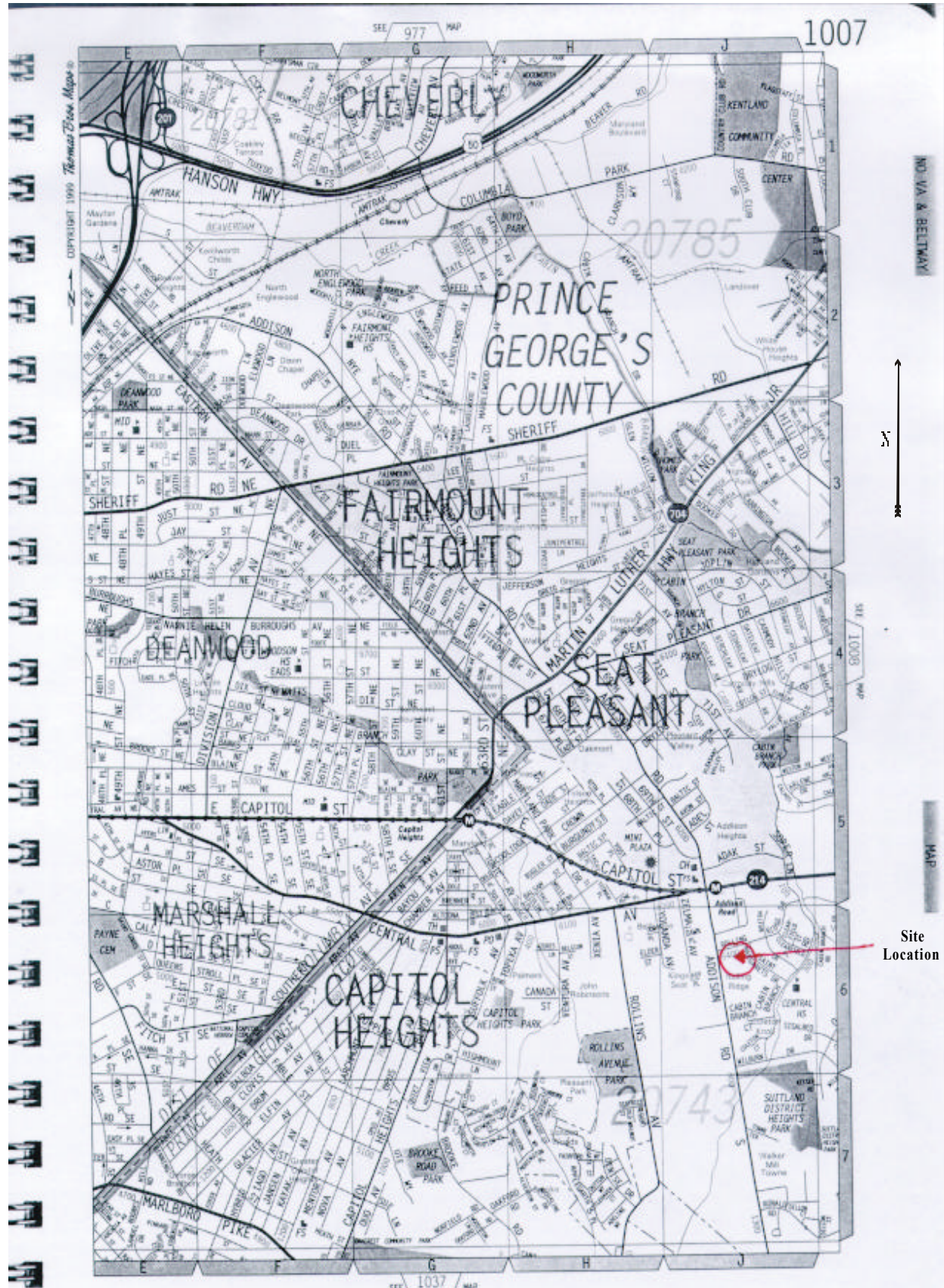
Figure 1. Facility Location