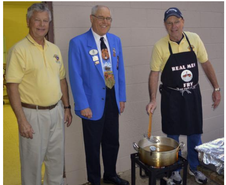
Fish Fry at Washington District Governor visit.