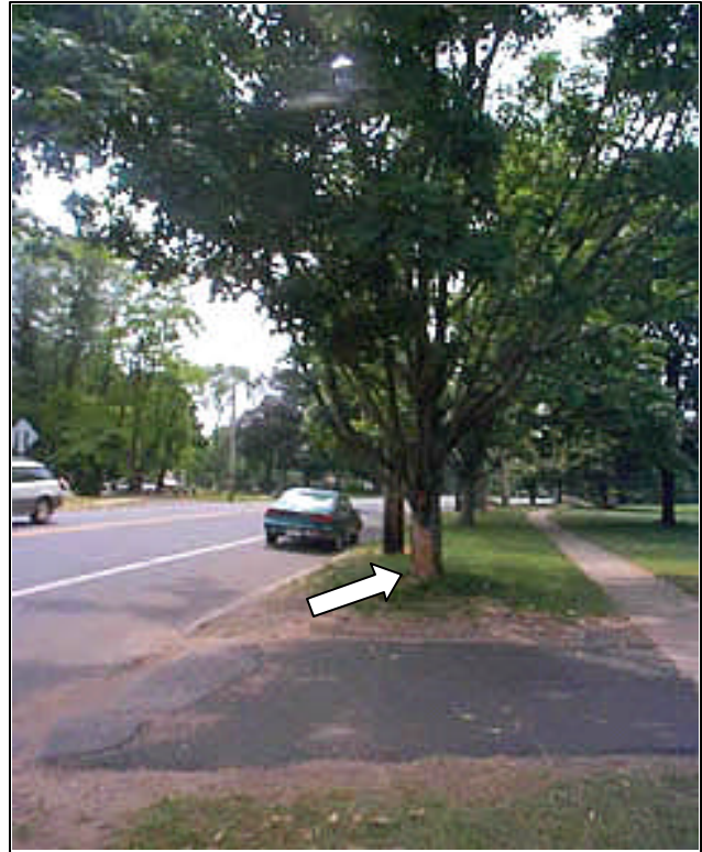
Photo 1 Photograph Showing Site of Impact