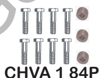
CHVA 1 84P