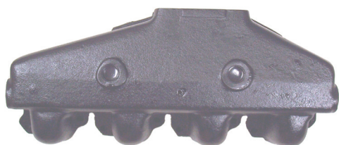
CHVA 1 84