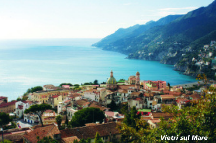
Vietri sul Mare