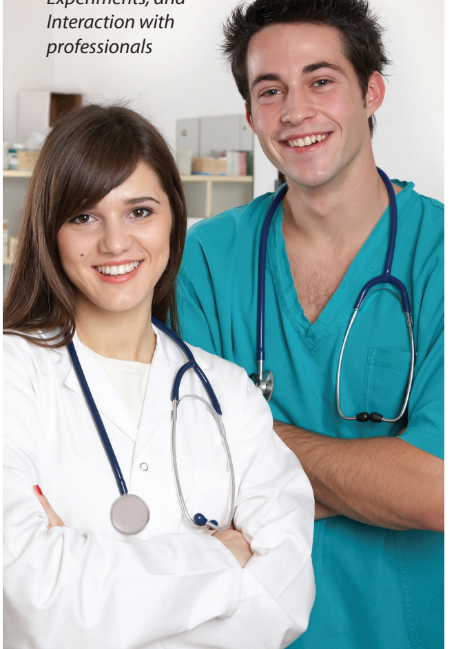
June 17, 18, & 19, 2013 High School Sophomores thru Seniors

Prepare for a Health Profession through Hands-on Workshops, Science Experiments, and Interaction with professionals