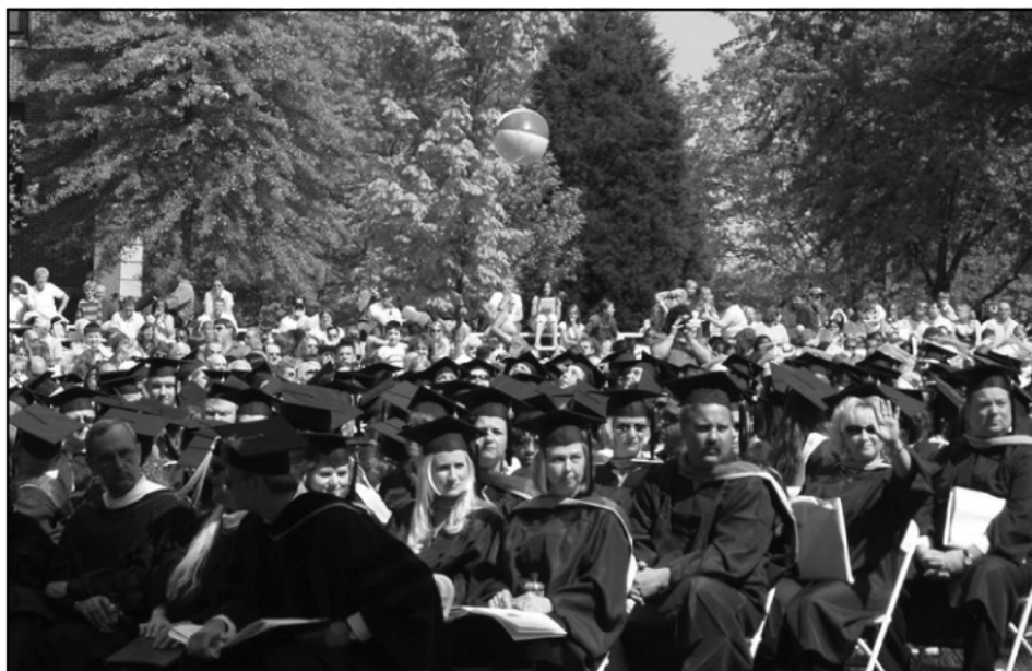
544 degrees were awarded to 526 students on May 6, making the Class of 2006 the largest in the history of the University of Rio Grande/Rio Grande Community College.

Alumni of the University can visit and reconnect with friends and former classmates through the University's on-line alumni directory. Visit www.rio.edu .