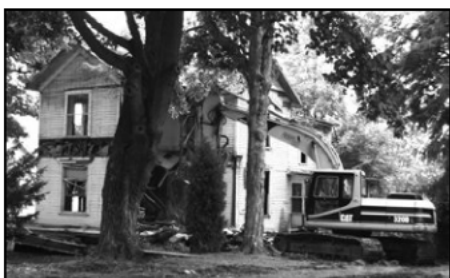
Destruction of the long-vacant Weiher properties (known to many as the Ewing property), located on the north side of the campus, occurred in early September. This land is now owned by the University.