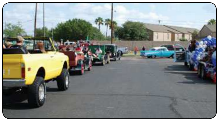
Classic and show cars lined up next to the floats in the parade staging area at Beverly Hills Intermediate School.