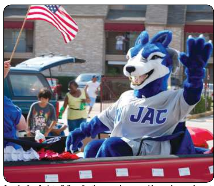
Jac, the San Jacinto College South campus' mascot, rides on the parade route waving to residents.