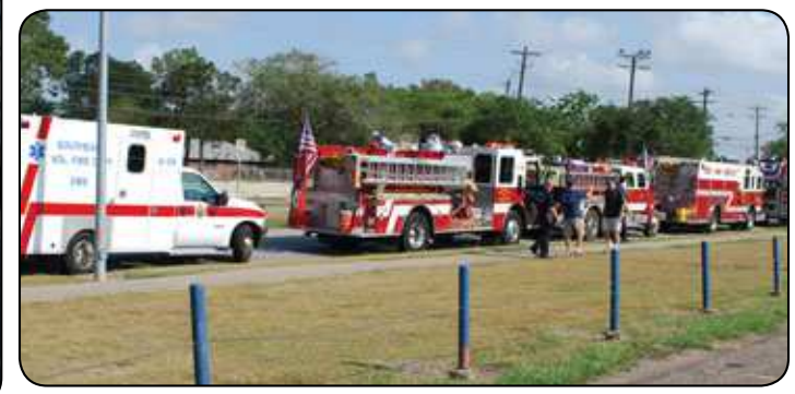
Emergency vehicles from the Southeast Volunteer Fire Department and City of Houston Station 70, line up for the July 4 parade at Beverly Hills Intermediate.