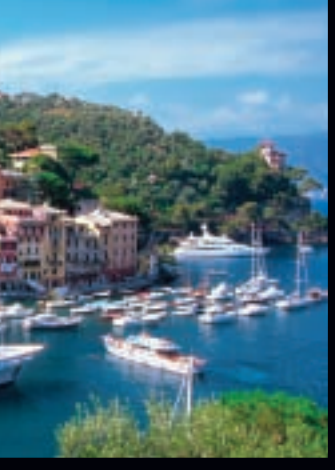
Far left: Florence Center (upper): Cathedral, Siena Center (lower): Vineyards, Cinque Terre Left: Portofino Left: View from Hotel Vis à Vis, Sestri Levante