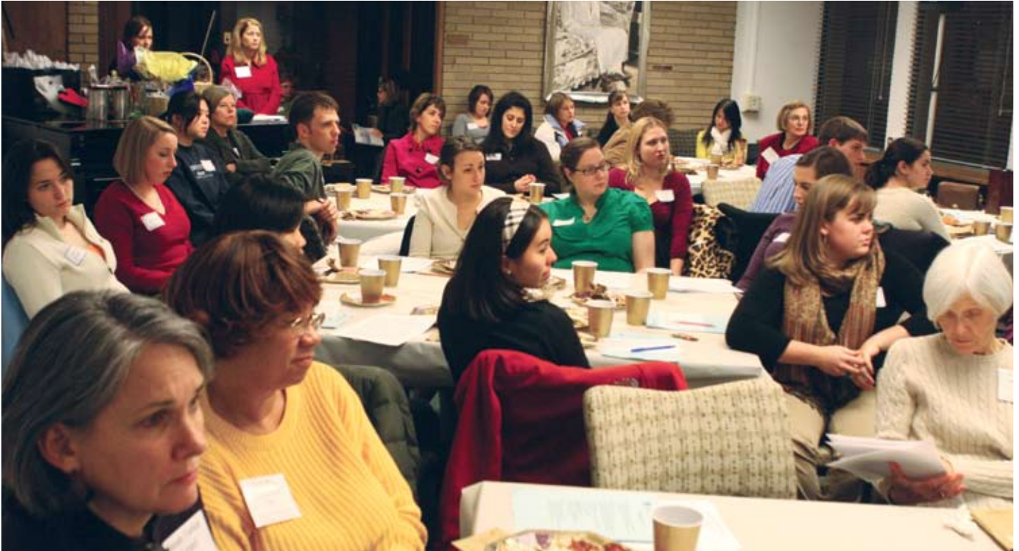
Nursing Career Connections 2008 drew a full house to the first floor lounge.