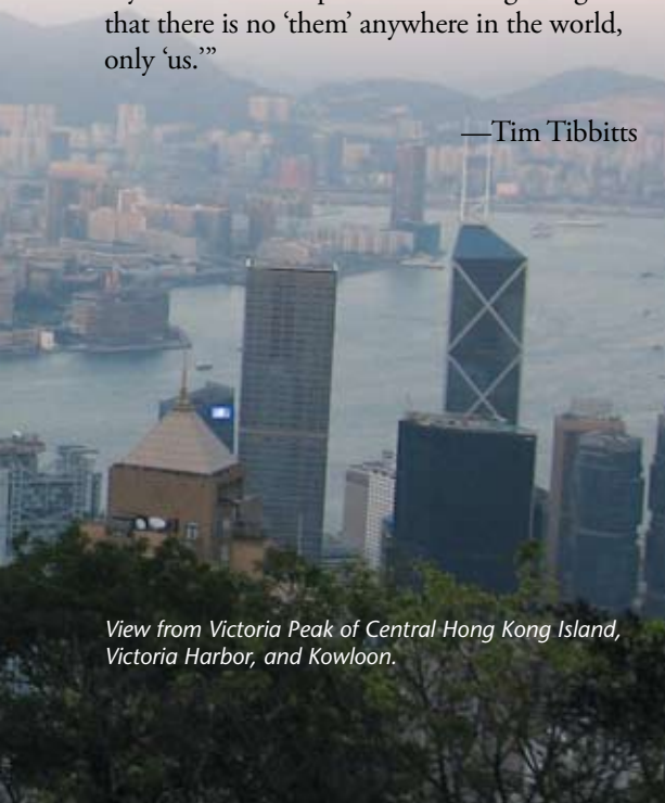
View from Victoria Peak of Central Hong Kong Island, Victoria Harbor, and Kowloon.