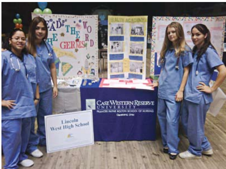
Participants in the Health Academy at Lincoln West" display what they've learned at a Cleveland Municipal School District School Fair in Fall 2008. BSN students will begin mentoring Health Academy students in Fall 2009.

Service. Learning. By combining these two imperatives, FPB's undergraduate program positively affects its community while effectively preparing the next generation of nurse leaders.