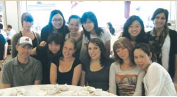
FPB exchange students enjoy a farewell lunch with HKU nursing students and exchange students from Sweden in Hong Kong.

Many of them comment that they've made friends for life. And we are beginning to identify some possible collaborations with faculty in our partner sites."