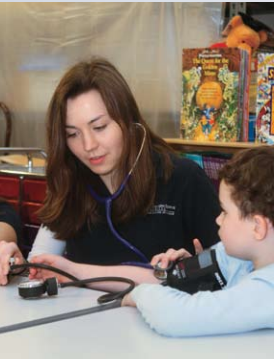
A BSN student takes a blood pressure during the school day.