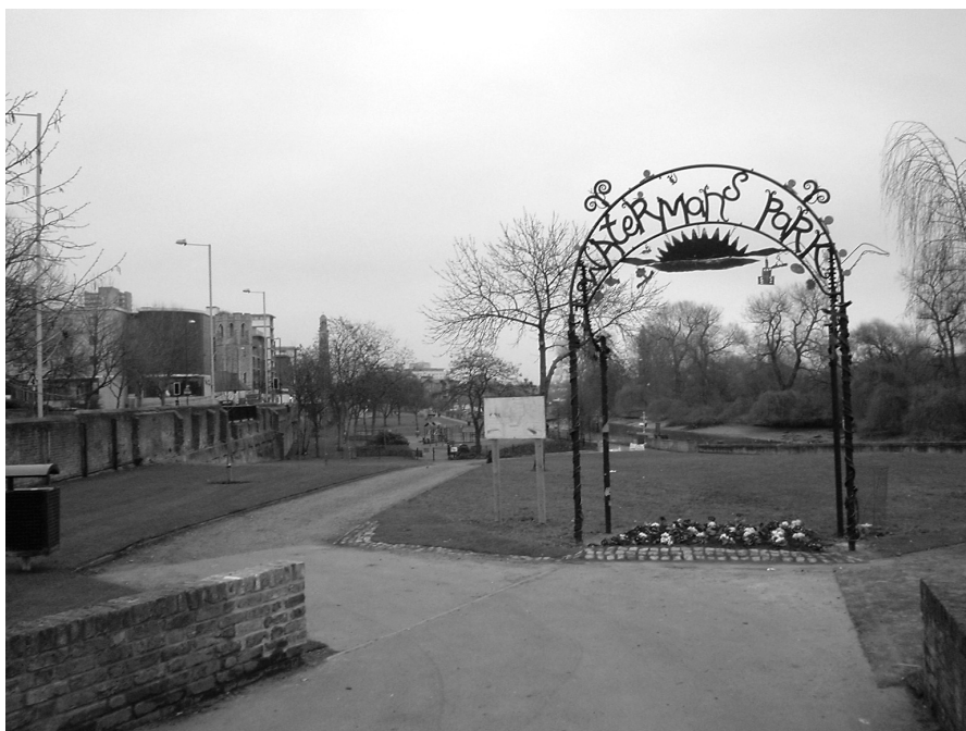
Figure 4. Watermans Park, Brentford: rehabilitated using planning gains associated with Capital West (far left).

"I'm not sure what you mean? I did not think the flats [CW] had provided any spaces. It is all private, isn't it?" (interview, 2005, CW resident).