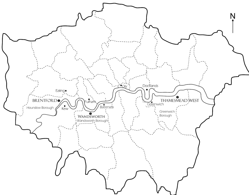
Figure 1. Location of study areas.

Fieldwork was undertaken in three neighbourhoods across London: Wandsworth, Brentford, and Thamesmead West during 2002–06 (see figure 1). Each was selected because it had recently (late 1990s onwards) witnessed the development of up-market, high-density residential apartments on brownfield sites. As a result, these neighbourhoods have all been undergoing gentrification (Davidson and Lees, 2005). This having