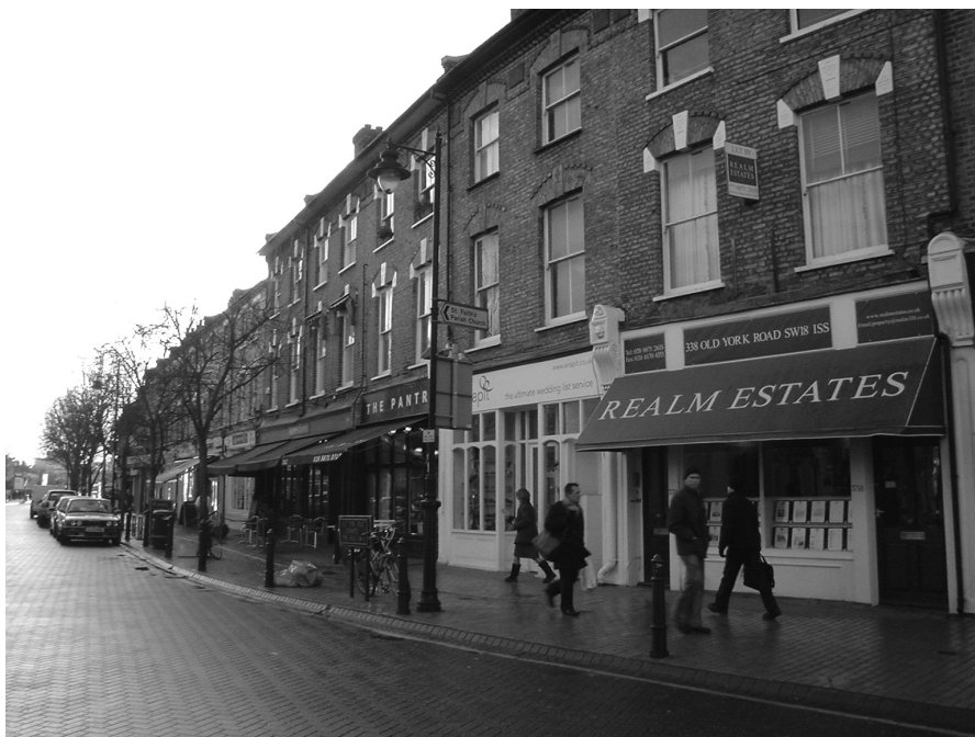
Figure 3. Old York Road, Wandsworth: a gentrified retail space shared by neighbourhood (classical) and development (new-build) gentrifiers.

“It is funny thinking about Brentford ‘cos I can honestly say I never gave it that much thought. This place [CW] was mainly the basis of my decision. It was a nice and safe place that I could get to work from” (interview, 2005).