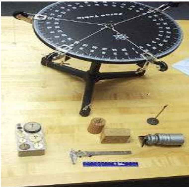
Fig. 5: Force table and masses

Add each of the three sets of vectors using the force table. (NOTE: The weight holder has a weight of 50 grams. Should this be included in your weight determination?) Estimate how well you can set and measure the angles, and estimate how well you can determine the mass of the fourth vector \vec{E} .