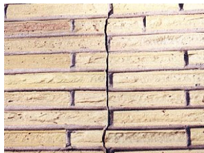
Fireplace air leakage

The homeowner has not experienced problems with drafts. There are indications that air is infiltrating through the walls and up through the attic insulation, reducing the insulation's effectiveness. An air seal-up would increase insulation effectiveness as well as reduce infiltration heat loss.