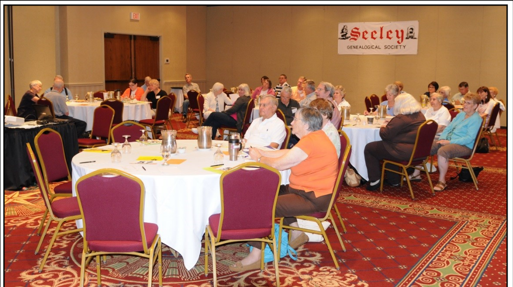
The general membership business meeting of the 2013 SGS International Reunion in Grand Rapids, Mich., kicked off at 9 a.m. Aug. 10, 2013. Among the decisions made at the meeting was selecting the site of the next reunion: Abilene, Kan.