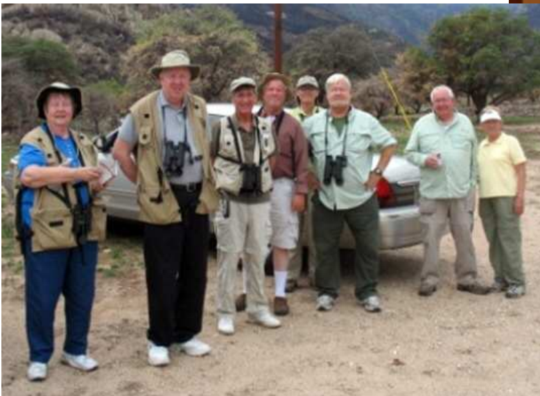
In our working gear