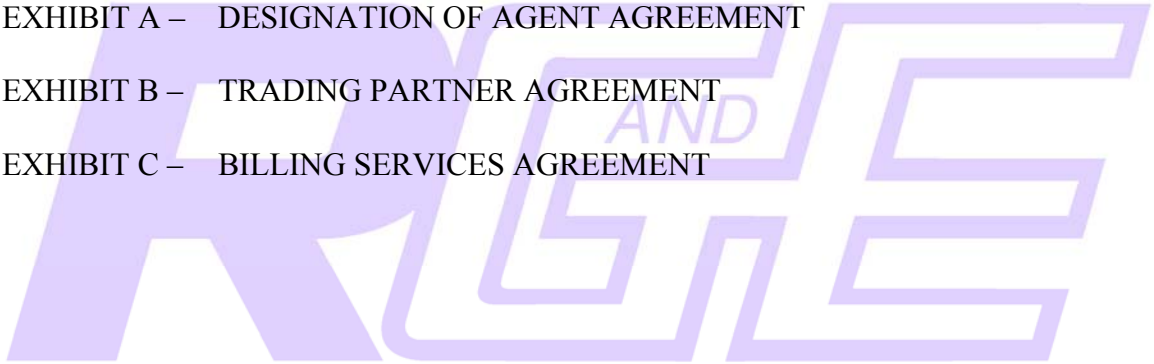
EXHIBIT C – BILLING SERVICES AGREEMENT