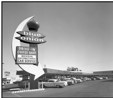
Blue Onion Drive-In