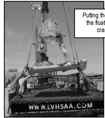
Putting the cat on the float with a crane