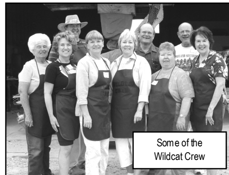
Some of the Wildcat Crew