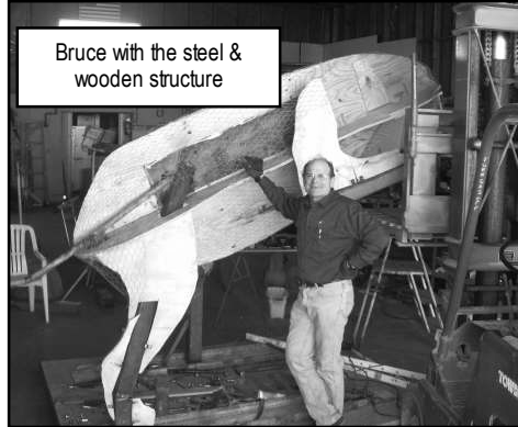
Bruce with the steel & wooden structure