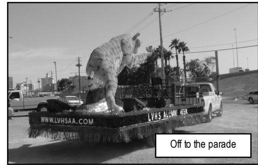
Off to the parade